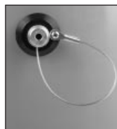
L90 – Highfield Lock with Steel Tether & Hex Self-Locking System