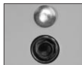
L00 – Hex Self-Locking System