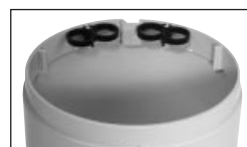
A04 – Drop Wire Organizer (Shipped Separately)