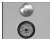
LS1 – Channell Star Self-Locking System