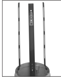
B8 – MB-8523 (2 ea.)