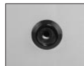
L07 – Threaded Lock Option with Shield (Less Lock) & Hex Head Self-Locking System