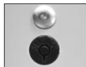
L01 – Standard Self-Locking System