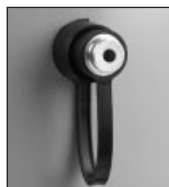
L09 – Highfield Lock with Plastic Tether & Hex Self-Locking System