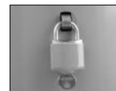
L08 – Channell Padlock & Hex Self-Locking System