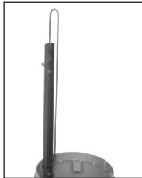
B2 – MB-8499