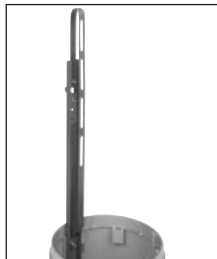
B1 – MB-8498