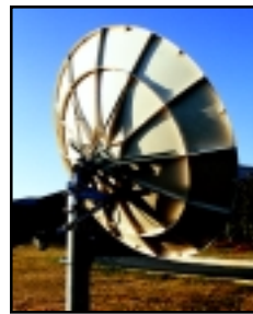
Back View Series 1253

Prodelin Corporation is the world's largest manufacturer of Rx/Tx VSAT antennas. We have the broadest product line in the industry including Receive Only, Rx/Tx and Rural Telephony antenna systems. Prodelin offers nineteen antenna sizes, 47cm to 4.5M. Prodelin is the leader in obtaining type certifications and approvals for Intelsat, AsiaSat and Eutelsat. Prodelin antennas provide the best quality in the market due to the sophisticated, precision SMC compression molding process technology. Prodelin provides the best value antenna solution to the market with competitive prices, the highest quality products and superb engineering support. Prodelin is ISO registered, KEMA # 70022.01. Prodelin - The Market Leader in VSAT Antennas.