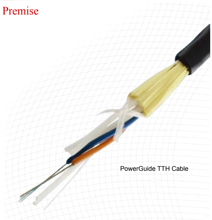
PowerGuide TTH Cable

To construct this cable, one to four optical fibers are placed within color-coded, gel-filled buffer tubes to protect the fibers from mechanical and environmental forces – creating a stress-free operating environment within the cable's designated load and temperature rating. Next, the buffer tubes are stranded around a dielectric central member using the reverse oscillating lay (ROL) stranding method to enable fast, mid-span cable entry. DryBlock® water-blocking material and dielectric strength elements are then applied to the cable core. Finally, a durable outer polyethylene jacket completes the cable construction.