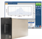
Optical Spectrum Analyzer FTB-5240S