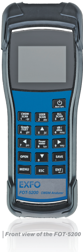
Front view of the FOT-5200