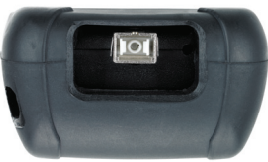
Top-side view of the FOT-5200