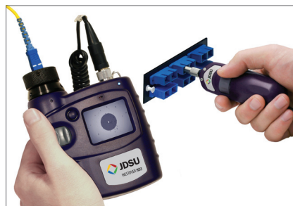
FBE Probe with HD3-P Display