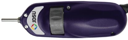
FBE Probe Microscope