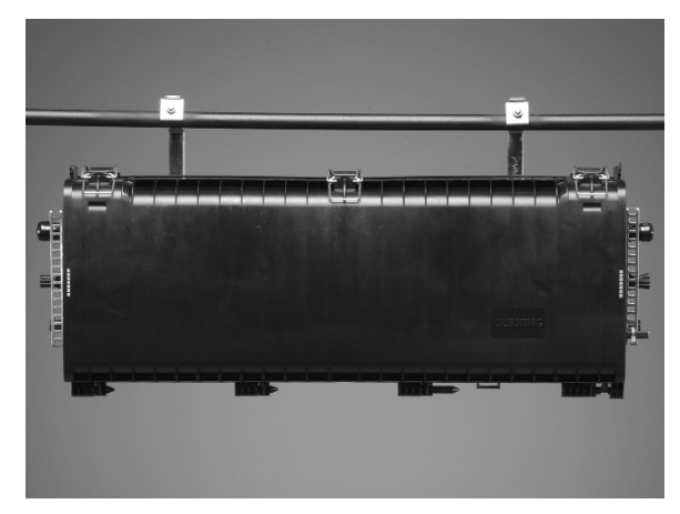
OptiSheath Classic Aerial Terminal (closed) | Photo SHD149