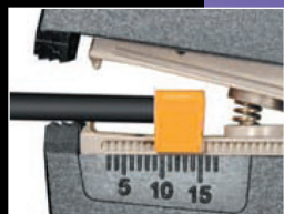
Adjustable Wire Stop