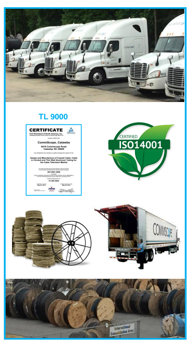
CommScope Cable Plant Catawba, North Carolina