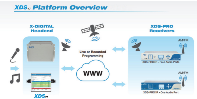
Broadcasting Live Over Satellite or Internet

Broadcast radio networks enjoy unprecedented audio quality, centralized programming & control of receivers, live & stored programs, localized advertizing & a cost-effective end-to-end solution.