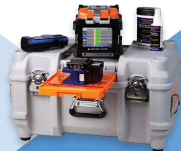
Quantum Transit Case as Work Surface