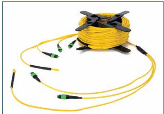
RPDpass Indoor Riser Cable on Collapsible Reel | Photo CCV113