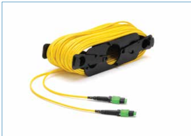
RPDpass Indoor Riser Cable Shown on Collapsible Reel | Photo CAR381

Utilizing low-loss MTP® Connectors ensures minimal impact to link loss budgets.