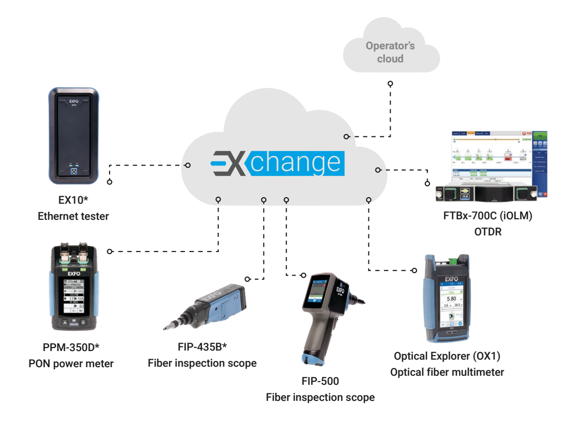
EXFO Exchange: EXFO'S collaborative software platform for deploying and maintaining high-quality telecom networks.

The EXFO ecosystem includes essential testers that are interconnected through EXFO Exchange, a collaborative software platform for deploying and maintaining high-quality telecom networks more efficiently. EXFO Exchange interconnects all aspects of the field test ecosystem (including field teams, test results, hardware and software) in a virtual hub. The platform automates and optimizes field testing and reporting, workflows, troubleshooting processes.