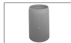
A32 – Extended Skirt