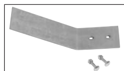
A02 – Anchor Kit (Shipped Separately)