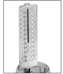
B9 – MB-8191