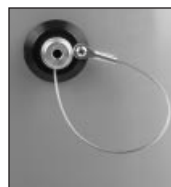
L90 – Highfield Lock with Steel Tether & Hex Self-Locking System