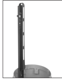
B3 – MB-8109