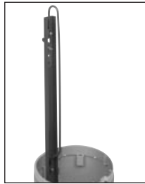
B2 – MB-8096