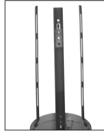
B8 – MB-8127 (2 ea.)