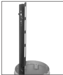
B1 – MB-8097