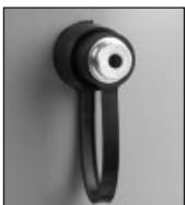
L09 – Highfield Lock with Plastic Tether & Hex Self-Locking System