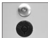
L01 – Standard Self-Locking System