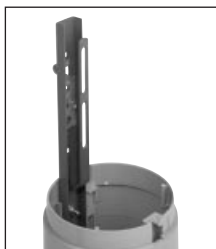
B1 – MB-8211