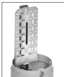
B9 – MB-8190