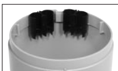
A01 – Trap/Filter Holder (Shipped Separately)