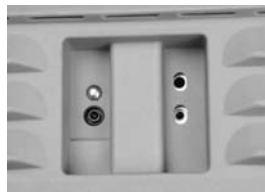
LH1 7/16" Hex Head Self-Lock