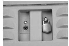
L08 Self-Lock with Channell Padlock