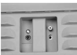
L09 Self-Lock with Highfield Barrell Lock