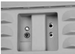
L01 Channell Self-Lock