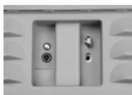
L00 Standard Self-Lock with Hasp