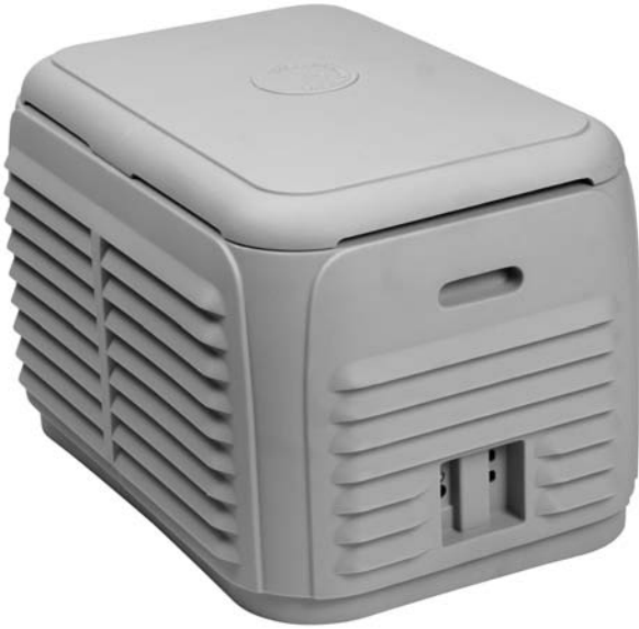
SPH2436 Self-Locking Heat Dissipation Cover