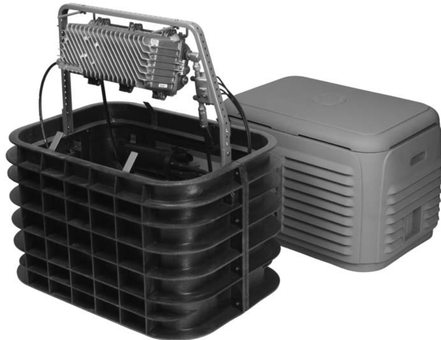
SPH2436 500 Series Signature Pedestal Housing