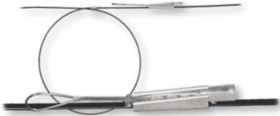
Diamond/Sachs drop wire clamp (aluminum 1-2 pair, serrated shim)