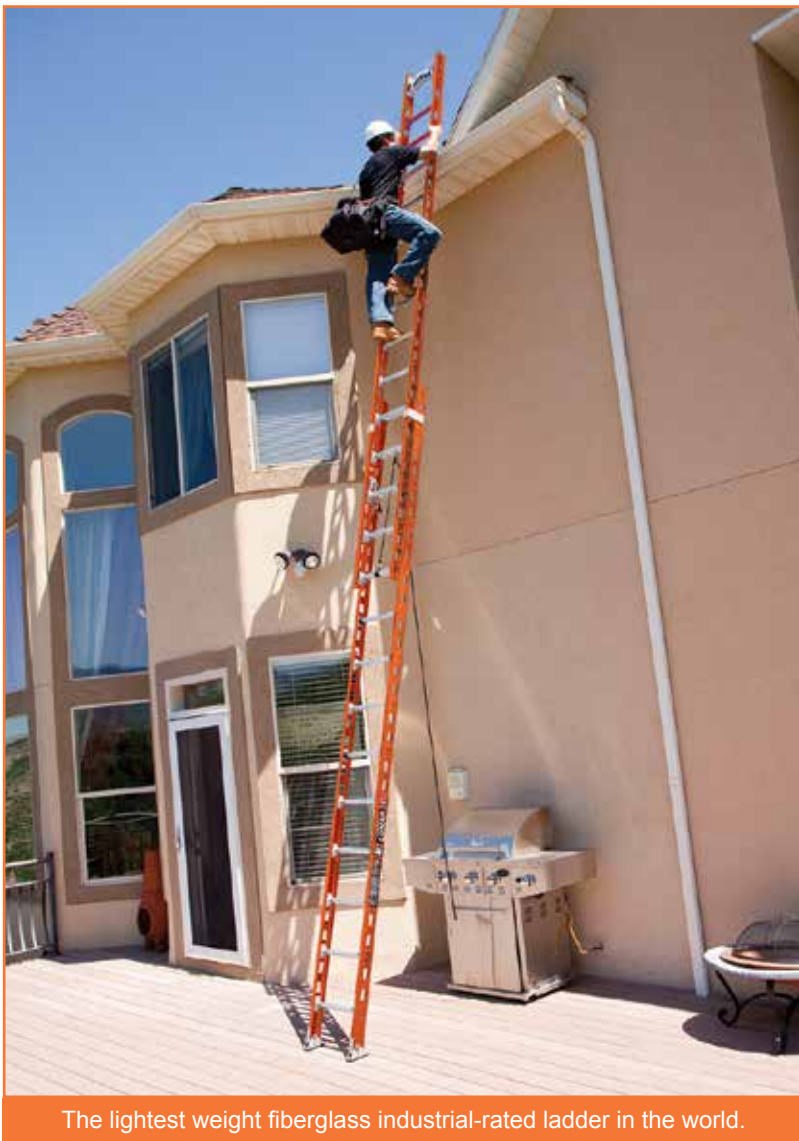
The lightest weight fiberglass industrial-rated ladder in the world.