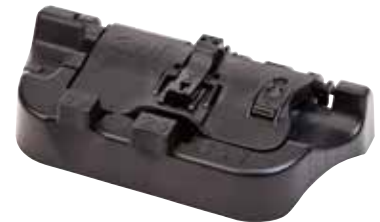
3M™ Easy Cleaver

*3M Easy Cleaver is included in select packages of 3M connectors and splices for a nominal increase in price.