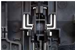
Diamond wire shuttle