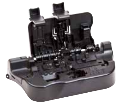
3M™ Easy Cleaver