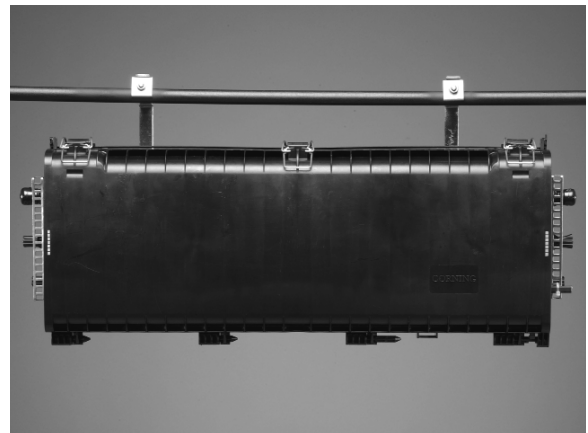
OptiSheath Classic Aerial Terminal (closed) | Photo SHD149