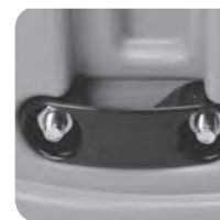
Self-locating Cover Security Lock Receiver