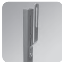
Bracket (B2 Shown)