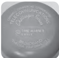
Private Label (A4 Shown)