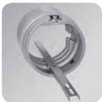
Stake (S2 Shown)