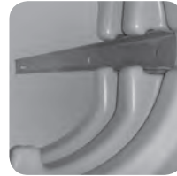
42" Joint Trench Stake P/N ST01001 (2 per ctn.)