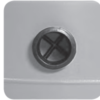
Winterized Drop (A1 Shown)