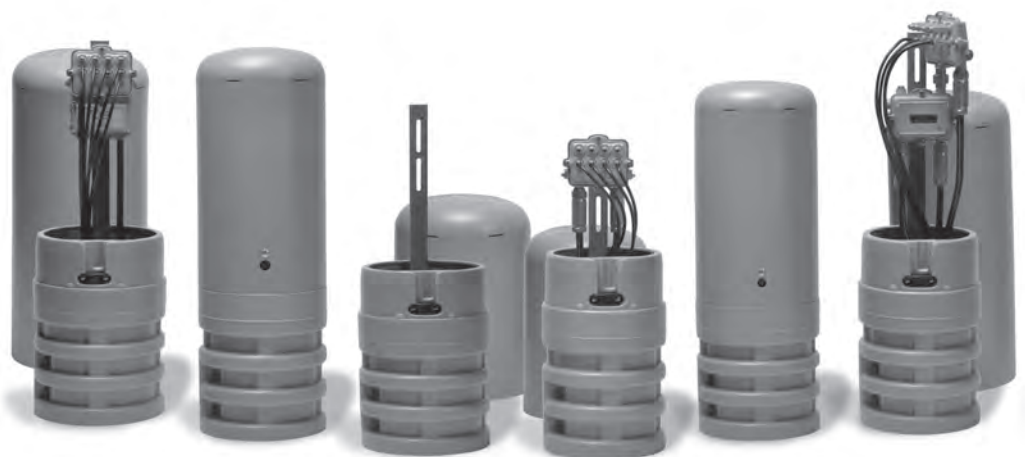
Challenger Pedestal Housing Series

A special self-locating cover ensures that the pedestals lock properly without requiring special alignment. The covers utilize Channell's proven Self-Lock® security hardware and tools used on all installed Challenger pedestals.