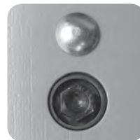
Lock (L00 Shown)