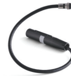
Available in AK Assembly