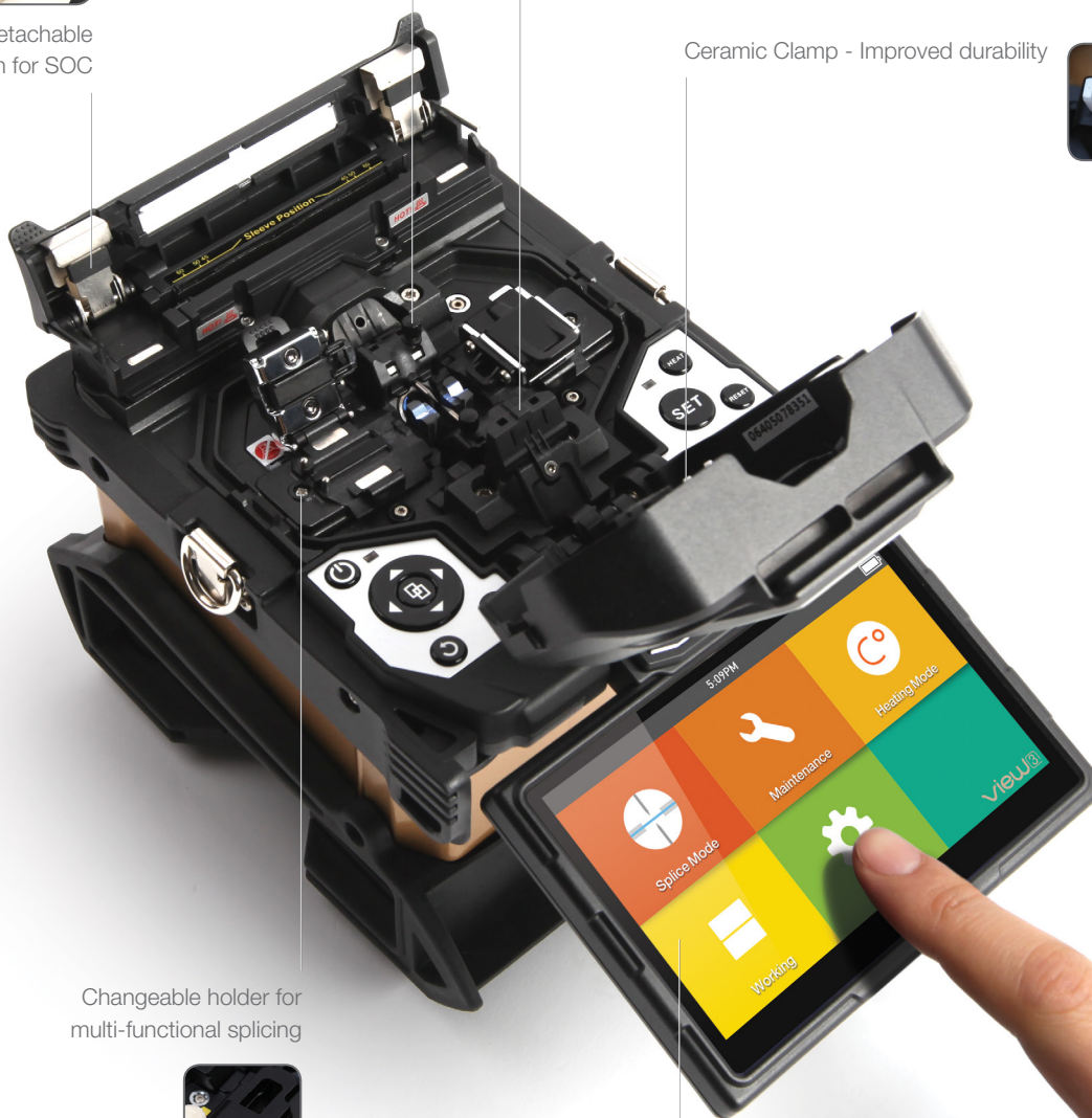
Changeable holder for multi-functional splicing